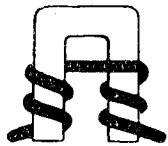
REC? TRADE MARK

NOTICE is hereby given that The GENERAL ELECTRIC COMPANY OF CHINA Limited, 16 Des Vœux Road, Hongkong, and 7 Jinkee Road, Shanghai, Electrical Manufacturers and Importers, have on the 10th day of January, 1912, applied for the registration in Hongkong in the Register of Trade Marks of the following Trade Mark:—