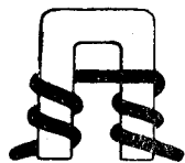
REC'D TRADE MARK

NOTICE is hereby given that The GENERAL ELECTRIC COMPANY OF CHINA Limited, 16 Des Vœux Road, Hongkong, and 7 Jinkee Road, Shanghai, Electrical Manufacturers and Importers, have on the 10th day of January, 1912, applied for the registration in Hongkong in the Register of Trade Marks of the following Trade Mark :—